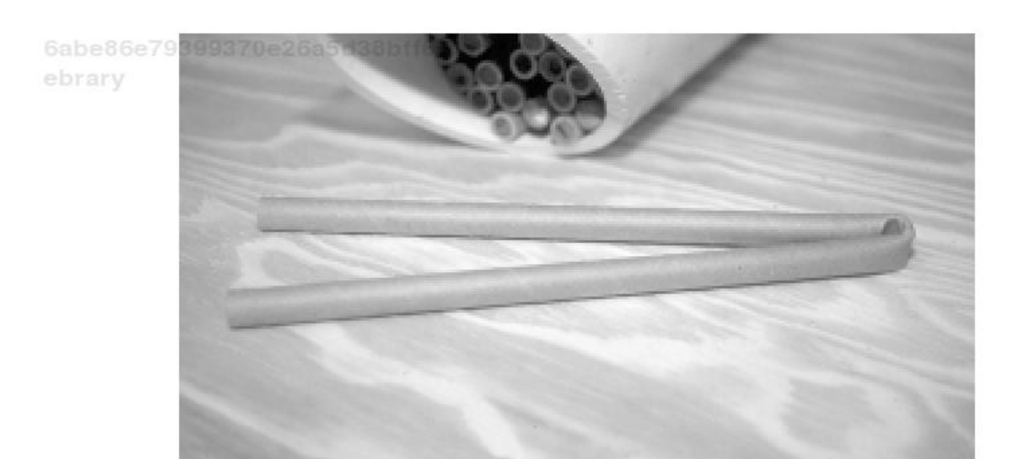
Fig. 12.2. Orchard mason bees will readily nest in cardboard tubes. Each tube is folded in half to produce two dead-end tunnels.

A horizontal section of white 3 in (7.6 cm) polyvinyl chloride (PVC) pipe makes a good shelter for bees nesting in cardboard tubes. One end of the PVC pipe can be cut at a 45° angle so that the top sticks out past the bottom and acts as a rain shield. The other end is closed with a plastic cap. The bottom part of the PVC pipe (the long run constituting the floor) must be at least 8 in (20.3 cm) long. One can then take standard \frac{5}{16} \times 16 in (0.8 \times 40.6 cm) cardboard tubes, fold each in half to make two 8 in (20.3 cm) lengths (tunnels must deadend or bees will not nest in them), and place a bundle of tubes