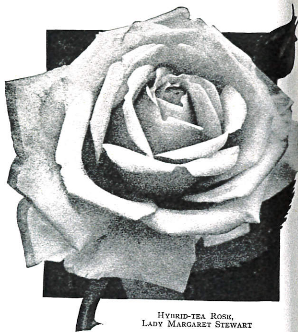
HYBRID-TEA ROSE, LADY MARGARET STEWART

Lady Dixon Hartland. Long pointed shapely buds and large flowers, deep salmon-pink at centre shading to lighter pink at the edges, very free and perpetual and sweetly scented. $2.50 each.