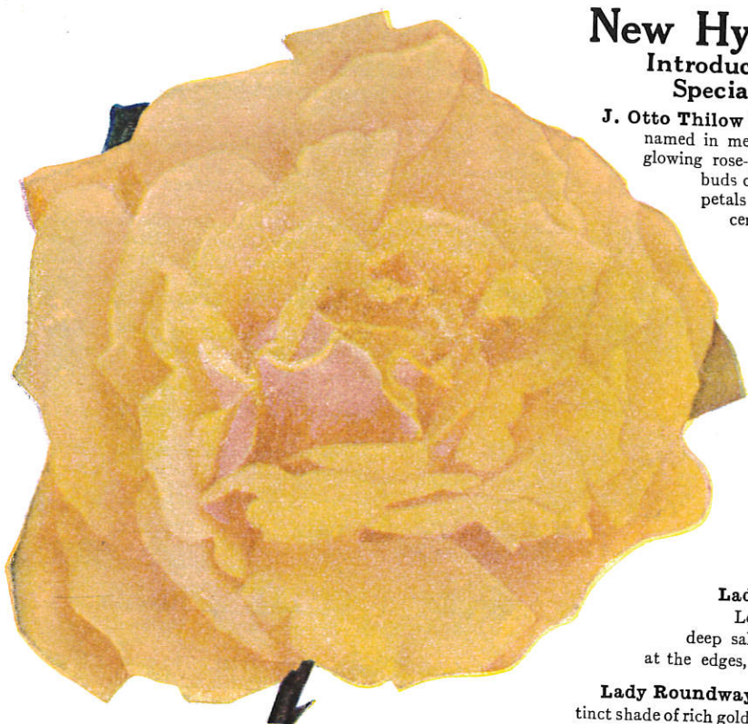
NEW HYBRID-TEA ROSE, LADY MARGARET STEWART

Lady Mary Elizabeth (Alex Dickson & Sons, 1927). A variety of outstanding merit that will be appreciated in the garden and for cutting. The plant is of strong vigorous, upright, branching habit with good healthy foliage and very prolific flowering. The delightfully fragrant flowers are carried on long stiff stems, the buds are very shapely, long pointed, and open to blooms of moderate fullness, with broad deep substantial petals, in color a brilliant deep carmine-pink without shading. $1.50 each.