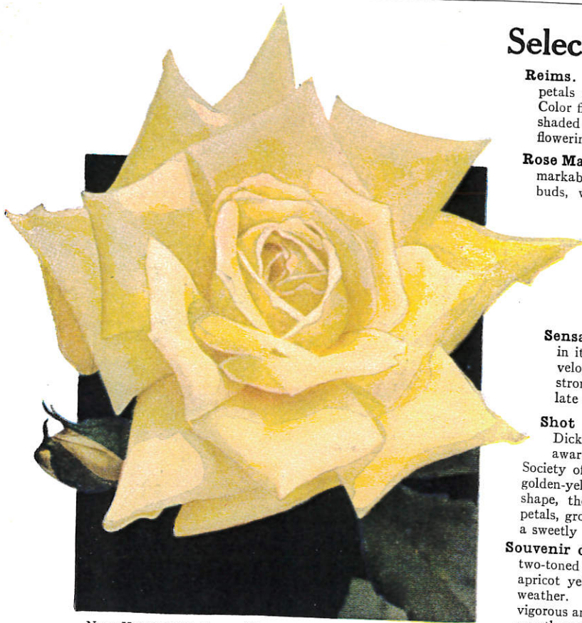
NEW HYBRID-TEA ROSE, MRS. ERSKINE PEMBROKE THOM

Souvenir de George Beckwith. A variety that is meeting with much favor, flowers very large, globular and full double, with petals of good substance. Color shrimp pink, tinted chrome yellow shading deeper at the base of the petals, the various shades blending very harmoniously, moderately fragrant.