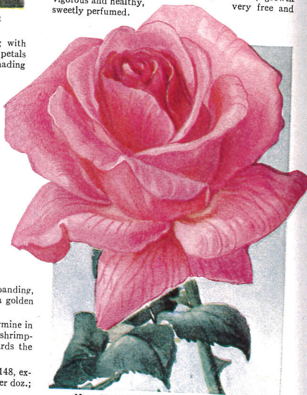
NEW HYBRID-TEA ROSE, J. OTTO THILLO

Souvenir de H. A. Verschuren. A most desirable two-toned yellow, the edges light buff deepening to apricot yellow at the centre, particularly rich in cool weather. Buds and flowers of capital form, growth vigorous and healthy, very free and sweetly perfumed.