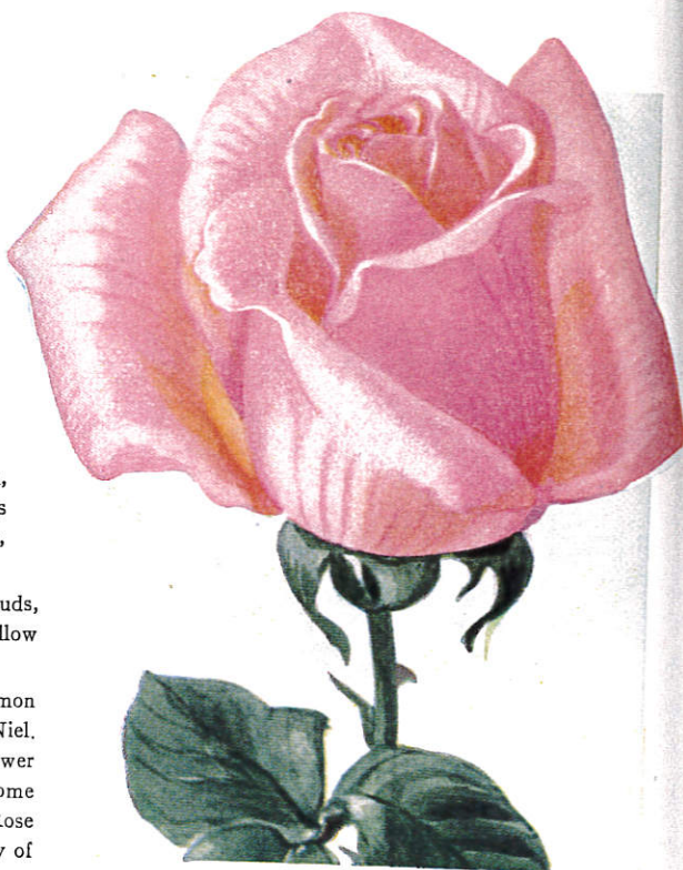
NEW HYBRID-TEA ROSE, LADY FLORENCE STRONGE

Lady Roundway (Cant & Sons, 1923). A striking and distinct shade of rich golden-orange with deep copper-chrome suffusion. Sweetly scented, free flowering, strong, vigorous dwarf habit. A Gold Medal variety that was very appropriately described by one of our Rose friends as a double flowering Angele Pernet. $1.50 each.